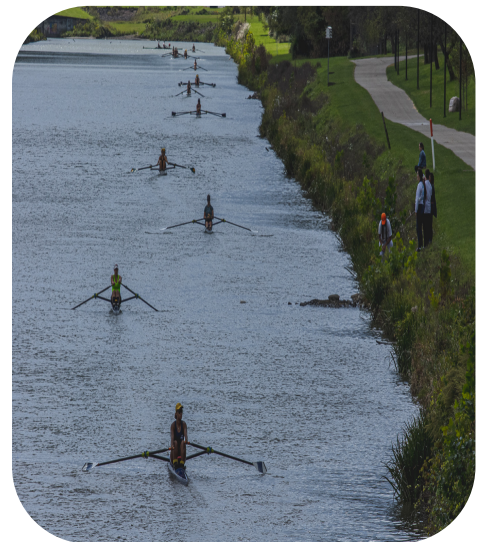
Sculling competitors on their way to the start of the 2021 Cayuga Sculling Sprints. Notice the improved bike path on the right – Come watch a home race soon!