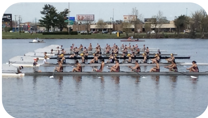
The women's v8, second from the front, lines up for the heat at the 2019 Knecht Cup on the Cooper River in Camden, NJ.