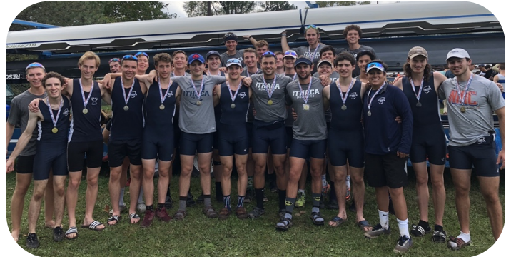
Men's squad photo, 2018 Head of the Genesee, Rochester, NY; three 8s', three medals, trailer loaded for home...a successful race!

The women sweepers, with a roster of 39, including 21 novices, had their share of positive experiences. With only four juniors (no seniors) this was the development group. They raced at the Head of the Genesee, the Bucknell Invitational, and the Charles (mentioned above). They attempted the Fish, but penguin weather (wet and cold) canceled their afternoon races. Scullers got done in the morning. The sweeps did host a scrimmage with William Smith and also competed in the "Touchdown the Bear, Cornell Classic," now an annual co-ed event hosted by the Big Red including crews from Syracuse, Hobart, and Mercyhurst.